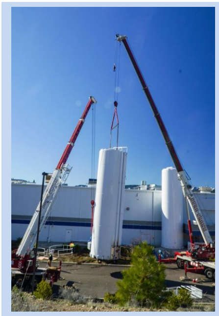
Water towers being removed from the former CGWC plant.

The appellate court ruled that two critical components of the FEIR did not comply with the California Environmental Quality Act (CEQA). In addition, the City failed to follow appropriate CEQA procedures, rendering the FEIR and associated permits invalid.