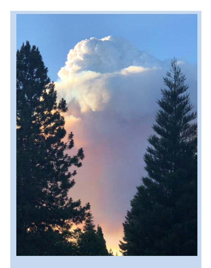
The Lava Fire raged near Mt. Shasta in Northern California in 2021.

W.A.T.E.R. has begun participating in local efforts to ensure forestry practices evolve from the current practices designed to prioritize timber harvest to a much needed ecological approach that is designed to prioritize carbon sequestration, protection of water resources and prevention of severe wildfires. By participating in a local "Stop Clear Cutting" group, providing input on forest service timber management plans and collaborating with other local groups, we are helping elevate the voices demanding a very different vision of the role our public forests play in facing the challenges of climate change.