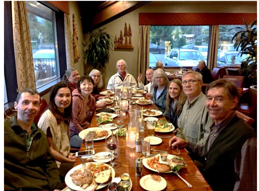
W.A.T.E.R. Board members, volunteers, and community members meet with representatives from the Japanese organization, Sui Do!

As a result, W.A.T.E.R. has introduced two new efforts in our local area: we are working with other community groups and Mt. Shasta City to install water bottle refill stations in public spaces, and we are educating the public about ways to reduce plastic pollution.